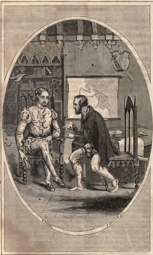
CONVERSATION BETWEEN AMERICUS AND COLUMBUS.